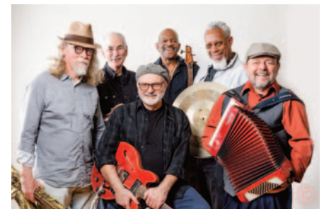
The Squeezebox Stompers