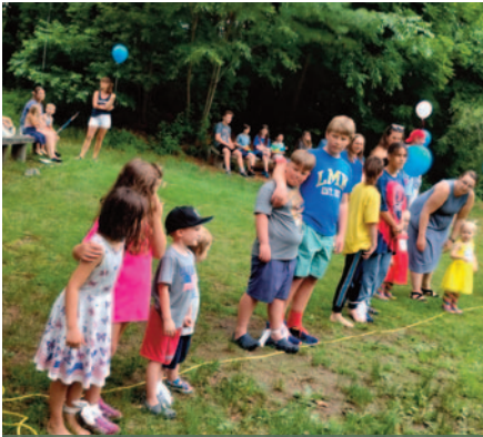
July 4th In the Ball Field