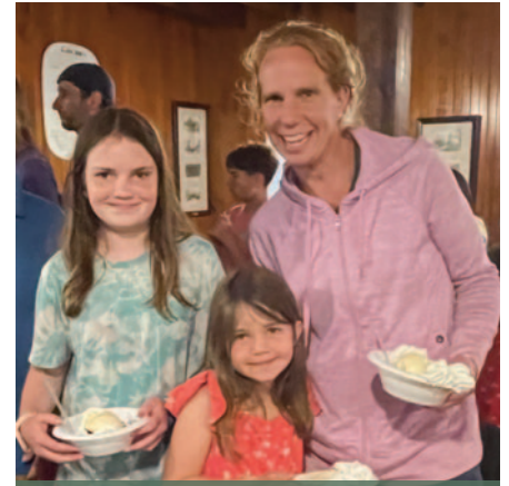
2024 Strawberry Festival

Weeding needed for several areas within our community. Many hands make light work. The sign behind the flag pole out front. The directory area at the archway entrance Across from the Dining Hall