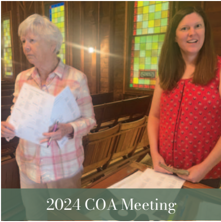
2024 COA Meeting