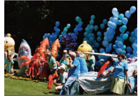
July 4th Parade 2022