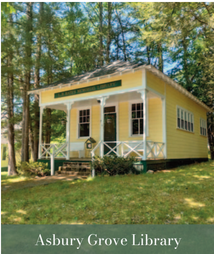
Asbury Grove Library