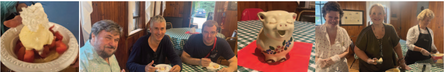
Ladies Aid Strawberry Festival 2024

conversation. It was a true celebration of community and the simple pleasures that bring us together. The Ladies Aid Committee outdid themselves, turning the Dining Hall into a strawberry wonderland dishing out homemade shortcake, fresh strawberries, scoops of vanilla ice cream, and dollops of whipped cream, proving once again that when women come together, they can turn strawberries into magic.