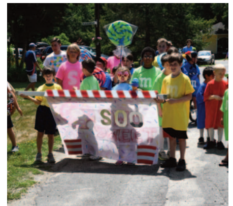
July 4, 2022 Youth Chapel

Your contributions will help inspire and support our talented youth. Thank you for your generosity!