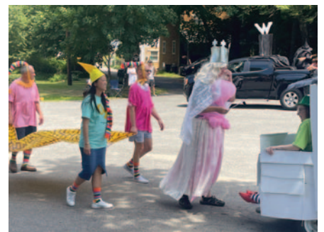
July 4, 2024

Save the Date: August 16 is Game Night in the Dining Hall at 7pm. Join the community for fun games and prizes.