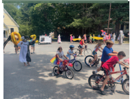
12 July 2024 | Page 4