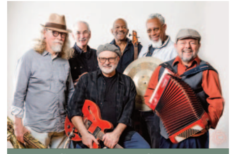
The Squeezebox Stompers