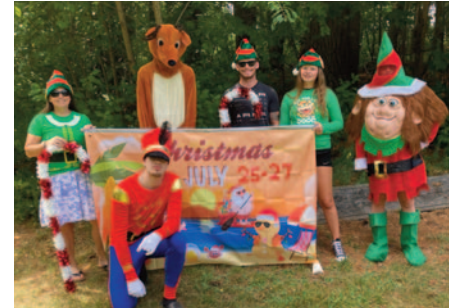
July 4th Parade 2024