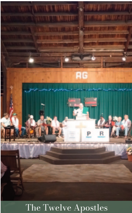
The Twelve Apostles