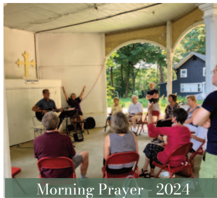
Morning Prayer - 2024