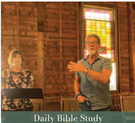
Daily Bible Study

Asbury Grove is seeking a dedicated part-time Office Manager. For the full job description, please visit our website at www.asburygrove.org/positions . Interested candidates should submit a cover letter and resume to secretary@asburygrove.org by August 16. This role is perfect for someone who is organized, detail-oriented, and enjoys working in a community-focused environment.