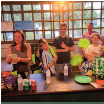
Youth Snack Stand