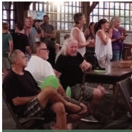
Camp Meeting 2024