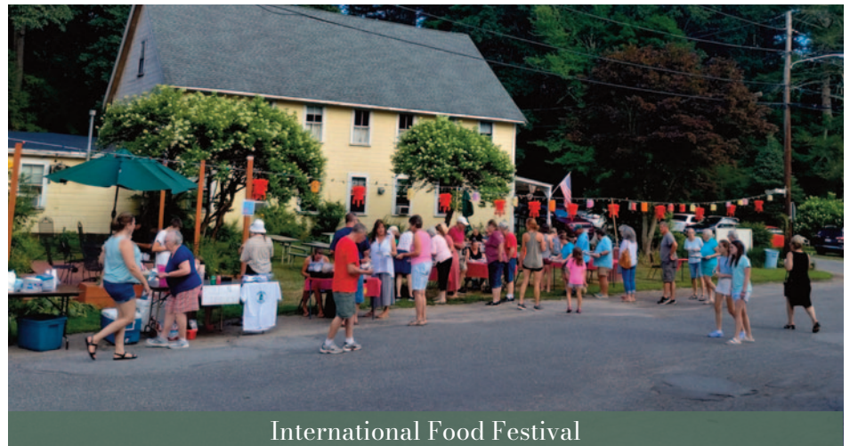
International Food Festival

We are blessed to have such a dedicated and supportive community.