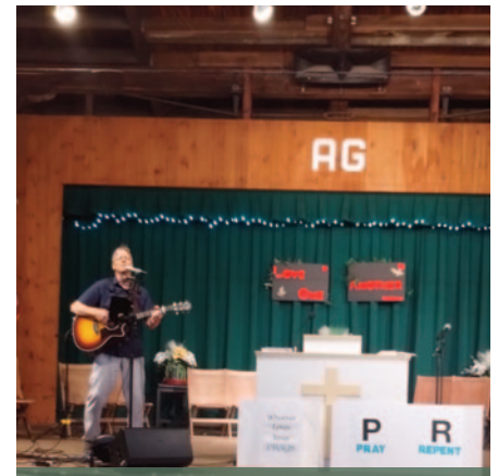
Camp Meeting 2024