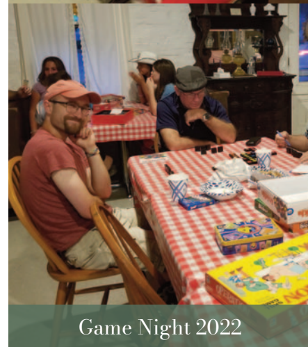
Game Night 2022