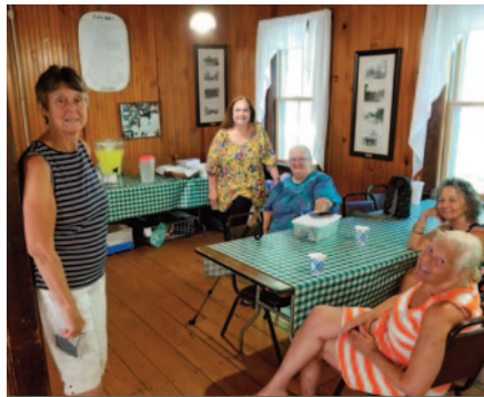
Ladies Aid Pie Social 2023

Asbury Grove is seeking a dedicated part-time Office Manager. For the full job description, please visit our website at www.asburygrove.org/positions . Interested candidates should submit a cover letter and resume to secretary@asburygrove.org by August 16. This role is perfect for someone who is organized, detail-oriented, and enjoys working in a community-focused environment.